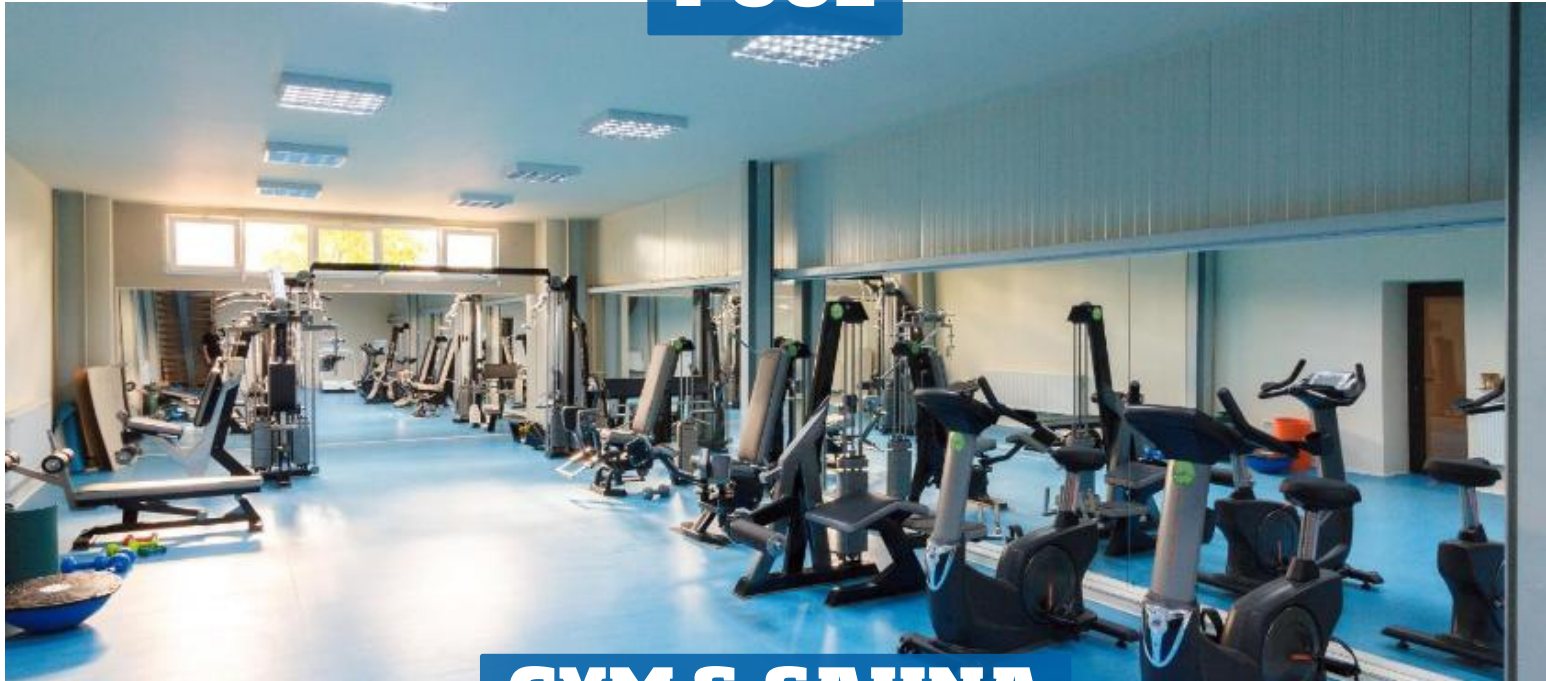
GYM & SAUNA